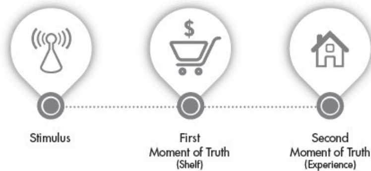
Figure 2-1: The traditional 3-step mental model

This model becomes disrupted when many consumers have a computer with them everywhere they go. Smart phones are in many consumer's pockets, and tablets are becoming the additional screen in the living room, so that even while watching commercials, consumers can cross-compare offers with competitors without ever leaving the couch. Not only can they compare your services to those of others (assuming they didn't fast-forward through your commercial with On-Demand TV services or TIVO) but they can check out online reviews to see what other consumers think of your offerings as well. Your reputation has truly preceded you, and is as much owned by the online search engines and various review websites as it is by you personally.